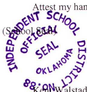
MINUTE CLERK, BOARD OF EDUCATION

Attest my hand and seal of the school district this June 30, 2016.